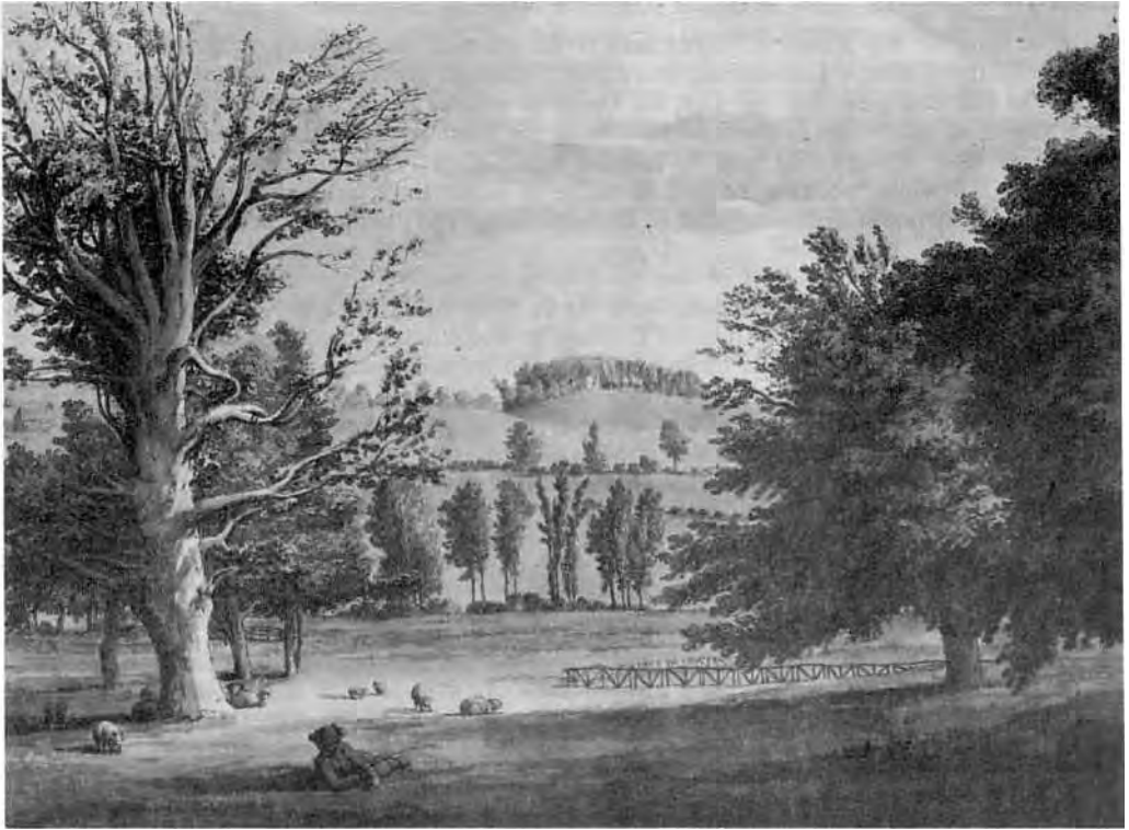
Figure 6. '... very pleasing; the wood singularly umbrageous. Many of the trees are remarkably fine ...' Arthur Young at Wroxton. A picture by Grimm (reproduced by kind permission of the Trustees of the British Museum. B.M. ref. Gough MSS. 15546/77).

R.P. 1780, it is seven feet four inches and a half in circumference at five feet from the ground: also an ash seven feet four inches by another bent towards the top; both these trees are of a vast height. The house is situated in the most recluse spot that can be imagined; apparently calculated for that sort of retirement which forbids the entrance of ambition, or of any tumultuous passion that could invade the quiet of this sequestered shade: how pervers, that it should belong to a prime minister [Lord North], who sought for happiness in levees of knaves and fools, instead of the society of his beeches, his ashes, his swans, his carps, and cows:—Which of these have proved ungrateful?