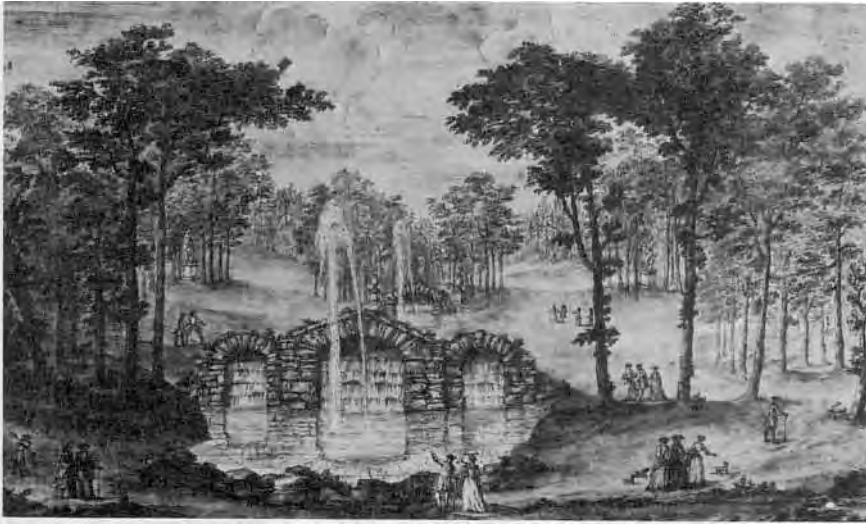
Figure 3. 'The sweetest little groves, streams, glades, porticos, cascades and river, imaginable . . .' Horace Walpole at Rousham. A picture still at Rousham.