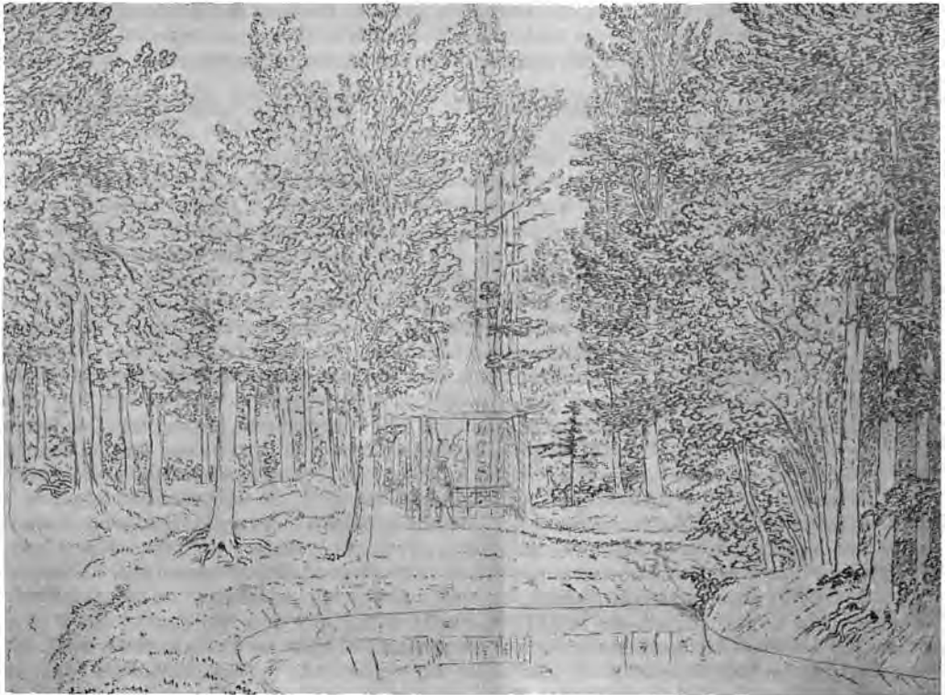
Figure 1. 'There are several paltry Chinese buildings and bridges . . .' Horace Walpole at Wroxton. A sketch by S. H. Grimm in 1781 (reproduced by kind permission of the Trustees of the British Museum. B.M. ref. Gough MSS. 15546/81).