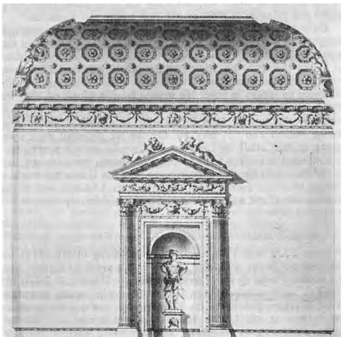
Figure 4. ‘Handsome gallery 81 feet long . . . Statue ill placed in a niche on the ground.’ Horace Walpole at Adderbury House. A sketch of Roger Morris’s design for the gallery in Adderbury House, 1730 (reproduced by kind permission of his Grace the late Duke of Buccleuch, from a photograph supplied by Tom Scott, Edinburgh).

‘Duke of Buccleugh’s. a large but very inconvenient House built at several times in a dirty shocking country, by John Duke of Argyle. The Architect was Campbell I believe or Gibbs, the taste as bad as Vanbrugh’s. It was a lodge of the witty Lord Rochester’s. There is his bed and great chair of purple cloth embroidered, and his Wife’s chair of red damask. a small part of the old house remains. The hall is horridly ornamented in Stucco. . . . Many family pieces of the late Duke of Argyle’s Daughters, their husbands and children. handsome gallery 81 feet long . . . . Statue ill placed in a niche on the ground.’