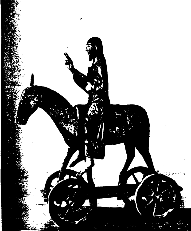
1. Palmesel from Steinen, Switzerland, in the Schweizerisches Landesmuseum, Zurich

At Augsburg and Essen in Germany during the Middle Ages, a striking feature of this Palm Sunday ceremonial was to bring into church the wooden figure of Christ riding upon an Ass (called a Palmesel).