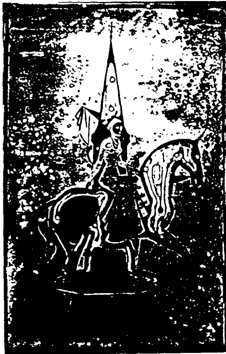
Printing block (Banbury Museum)

In the 1930s this book was compulsory reading for all those who eschewed being a bore at dinner parties. Put your biro and pad under your pillow and dream hard. You will find that history, like time, is a continuum of past, present and future. But first buy this book NOW, before you find that NOW has moved on or is irretrievably left behind. The number of your mantelpieces will then need to be increased to hold the number of dinner invitations you will receive.